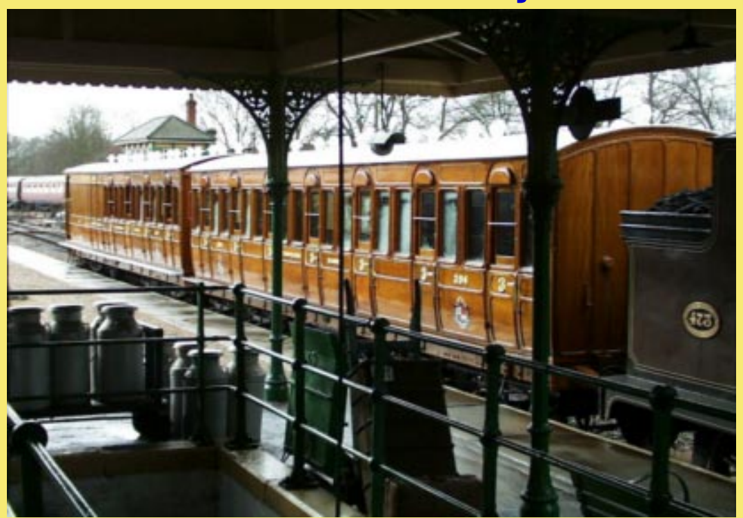
The first two restored Metropolitan Railway Ashbury coaches pause at Horsted Keynes during their January 1999 test run. (Lewis Nodes)