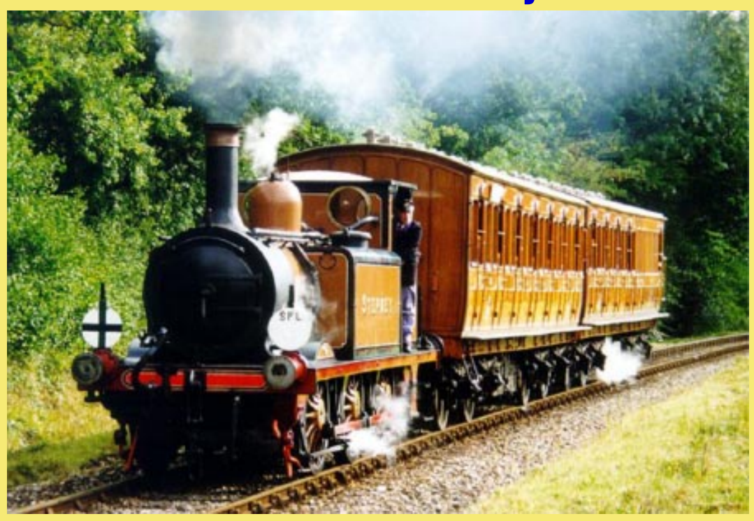
LBSCR Terrier 55 "Stepney" with two Ashbury coaches during one of the 1999 Victorian Evenings.