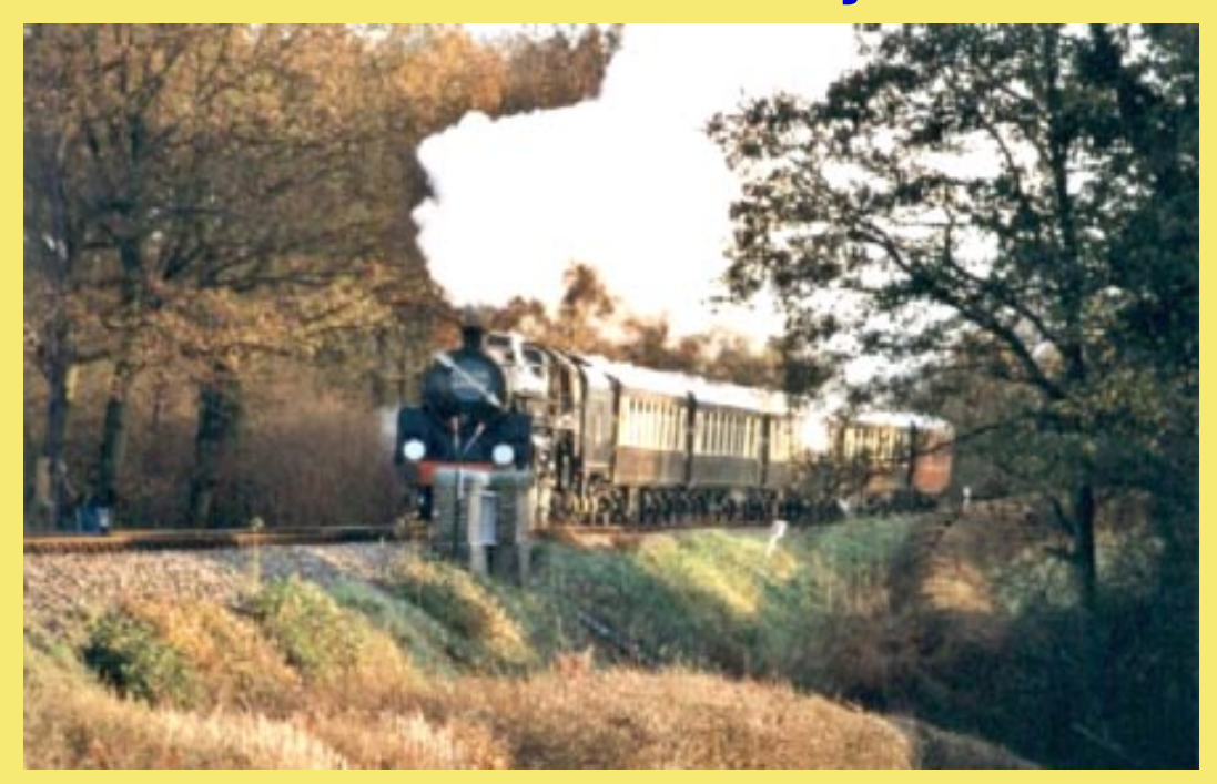
73082 "Camelot" with four 1920's/30's Pullman cars on the Bluebell's popular Golden Arrow dining train. (Robin Frankham)