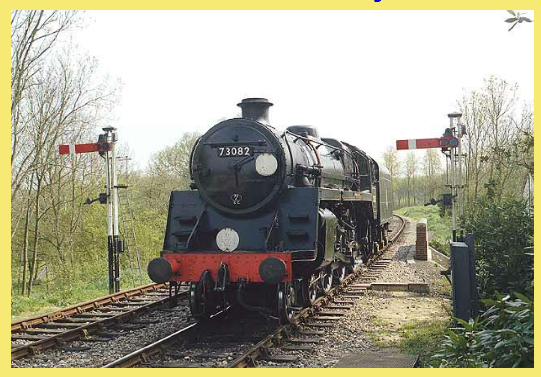
No.73082 "Camelot" at Kingscote Station. The Southern Region used names from withdrawn members of the King Arthur class on its BR Standard Class 5s. Camelot is the only named survivor. (Hiroshi Naito)