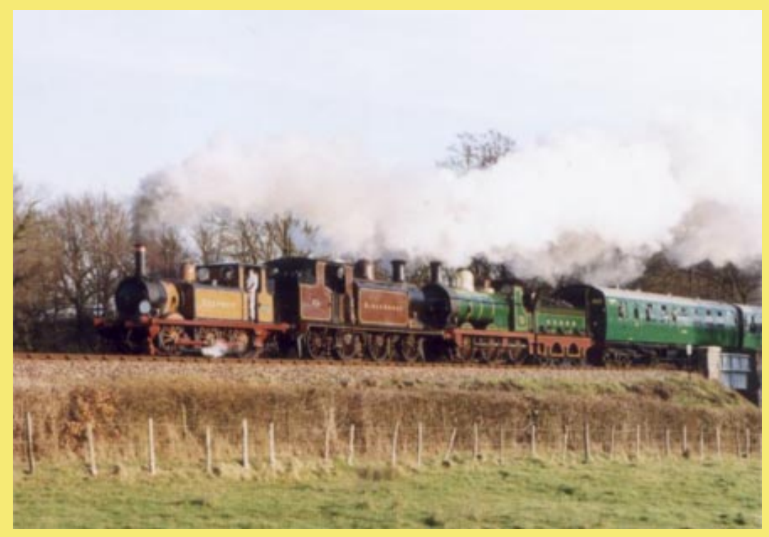
Triple-header of 55 "Stepney", E4 473 "Birch Grove" and O1 No.65 passing Holywell on the Sunday of the 2000 "Winter Steam Up"