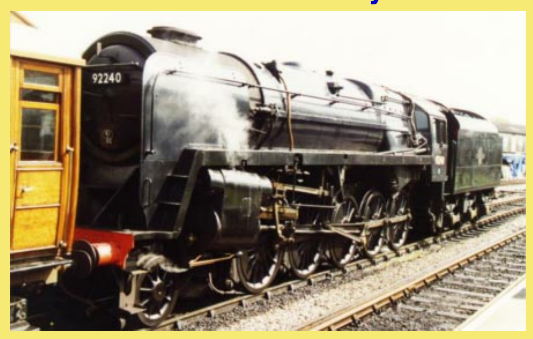
No.92240 was the first ex-Barry scrapyard 9F to be restored. It has proved surprisingly economical in Bluebell service.