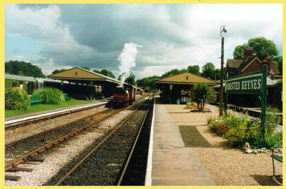
One of the Bluebell's real glories, the expansive Horsted Keynes Station, showing the completed Phase 1 of the Platform 1/2 canopy replacement project. (Richard Salmon)