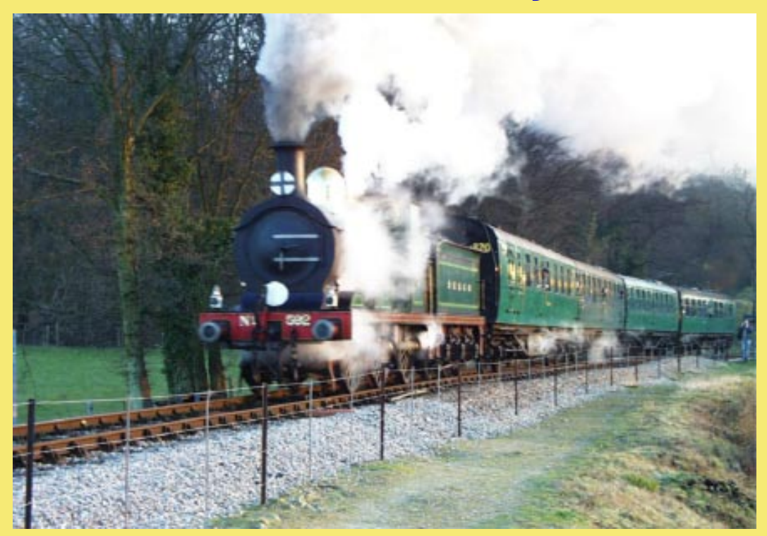
SECR C-class 592 with four Bulleid coaches North of Horsted Keynes at the 1999 Branch-line weekend.