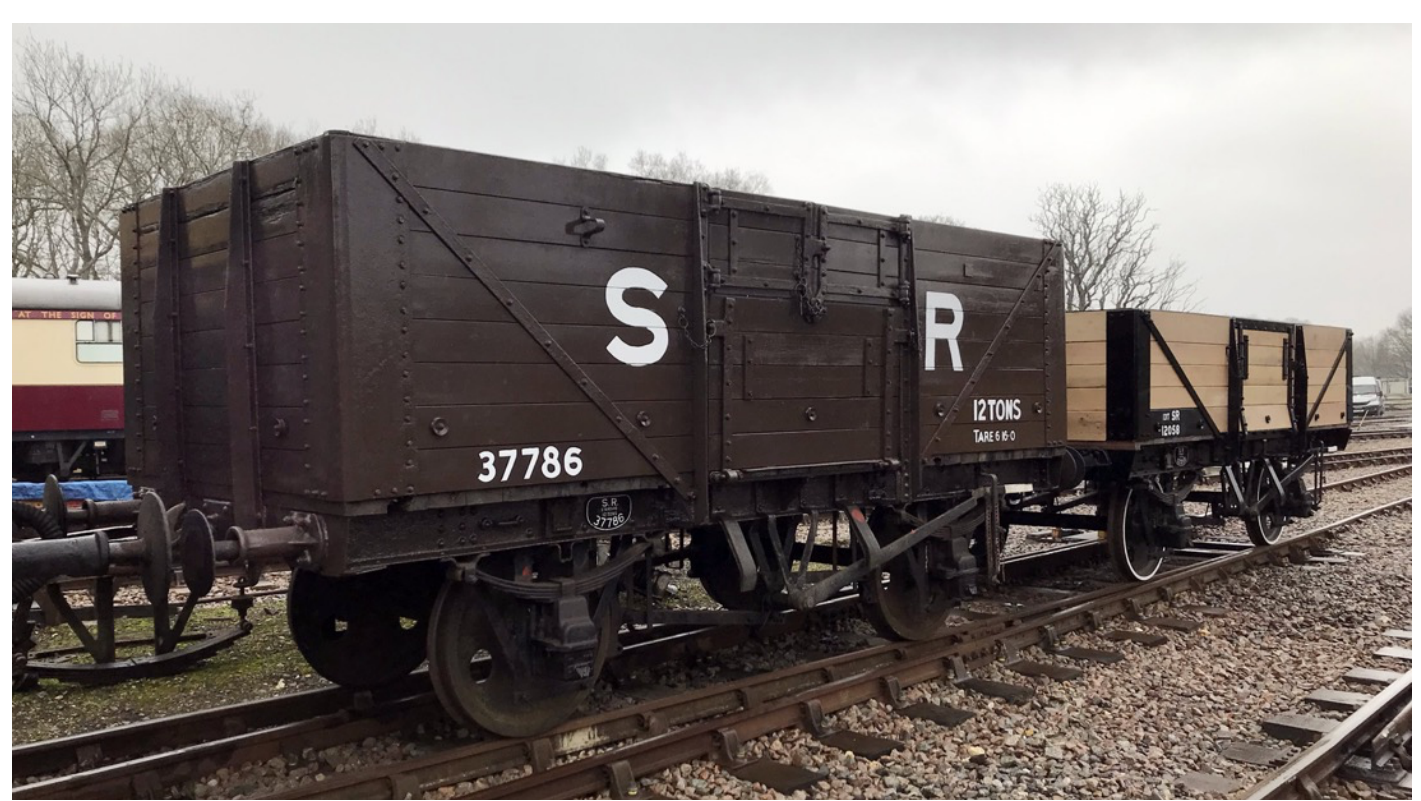
Richard Salmon - 22 February 2023

37786 is seen under stormy skies on the following Wednesday, in the company of 12058 (which still requires a tiny amount of work to complete it, largely the Tare weight lettering) having been shunted out of the shed the previous day.