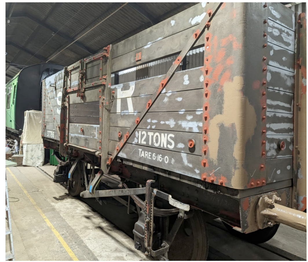
Matt Lander – 15 February 2023

The three replacement planks are yet to be fitted.