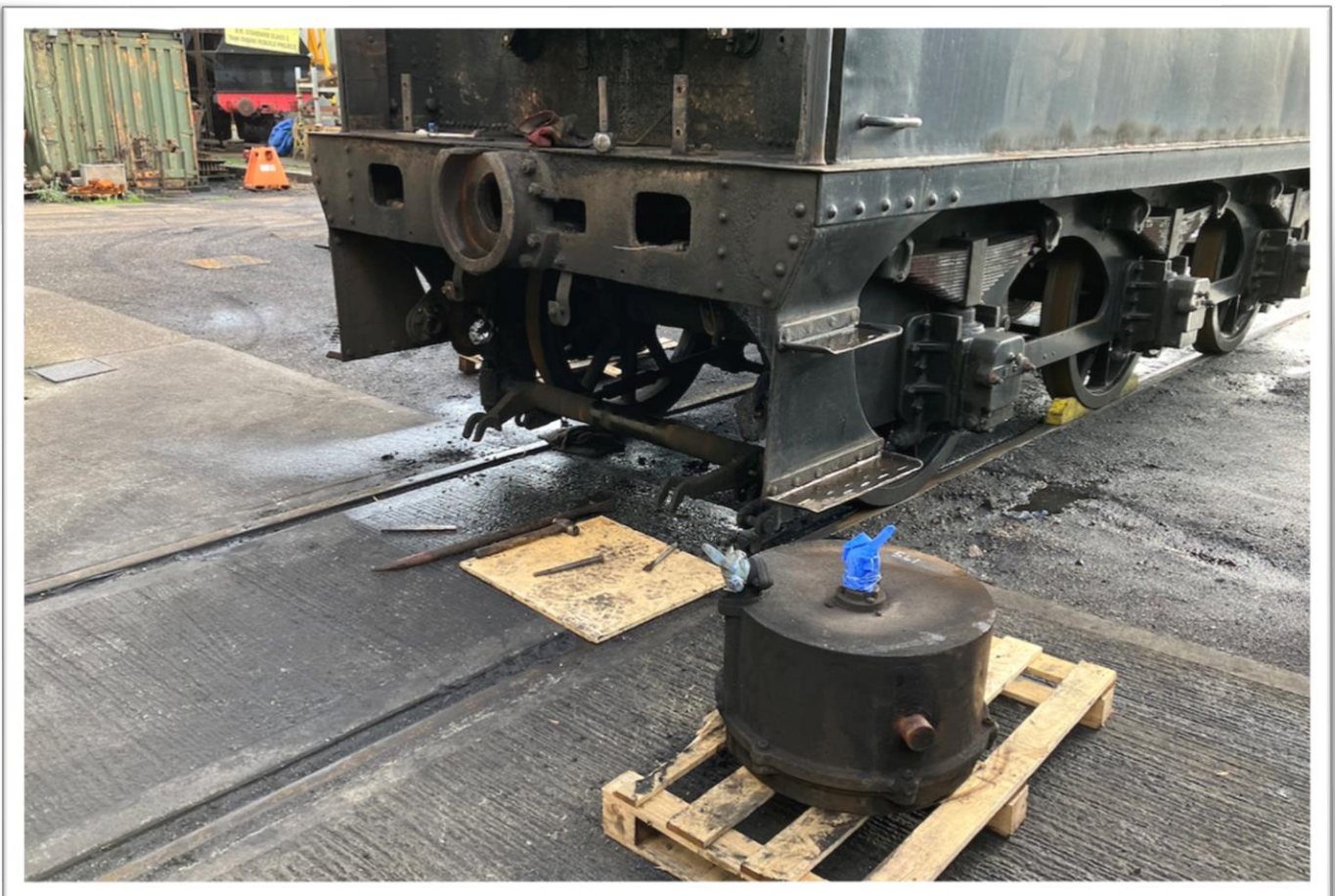
Above: One of the tender's brake cylinders, having been extracted from under the tender.

some preparatory work on the superheater header. As regards the tender, Melvyn Frohnsdorff has been busy freeing up the tender tank to enable it to be lifted to gain access to the frames in order to assess their condition. This has involved dismantling various lengths of pipework suspended underneath and extracting the vacuum and brake cylinders. The tender tank mounted sandboxes and associated pipework also had to be removed. The working party have commenced work on dismantling the brake rigging and cleaning/painting parts taken off the tender. In due course the tender tank will be lifted and the wheelsets sent away for tyre turning. There will be plenty of work for us cleaning between the frames and addressing any work required to dragboxes etc.